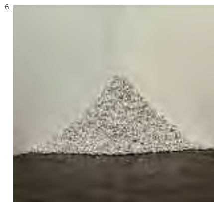
7 "Untitled", 1991 Billboard Dimensions vary with installation Installation at 31-33 Second Avenue at East Second Street, Manhattan, for Projects 34: Felix Gonzalez-Torres at The Museum of Modern Art, New York, 1992