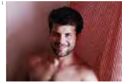
2 Snapshot, Pebbles and Biko, 1985