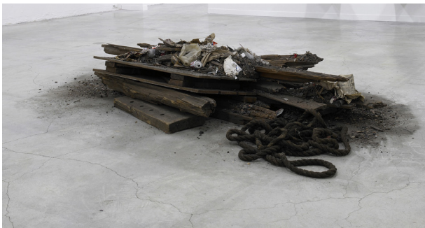
Laurie Parsons, Troubled , 1989. Mixed media, variable dimensions. Exhibition view «The Third Mind», Palais de Tokyo, 2008. Collection Le Consortium, Dijon.