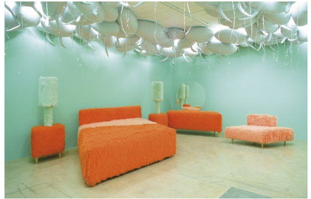
Sylvie Fleury, Bedroom ensemble (Hommage à Claes Oldenburg) , 1997. Exhibition view « Vivement 2002 ! Le jeu des 7 familles » with Philippe Parreno, Speech Bubbles, 1997, MAMCO, 2009. Collection MAMCO, Geneva. Environment. Furnitures of a room covered with fur (according to a bedroom of a motel in Malibu «Las Tunas Isles» already revised and corrected by Claes Oldenburg). Synthetic fur, foam, frames